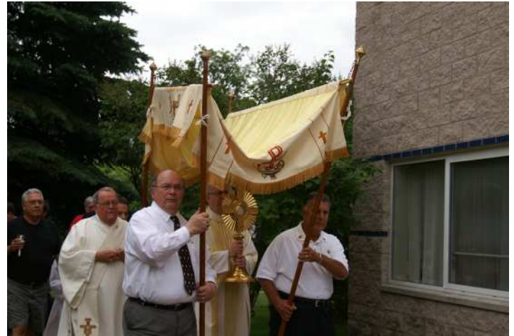
Feast of Corpus Christi